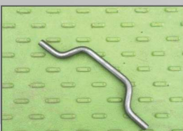
Single Steel Joiner