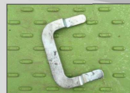
Single Low Profile Joiner