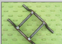
Double Steel Joiner