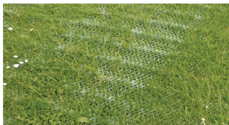
After 2 weeks