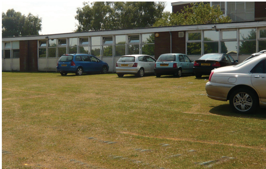
Site now in use

Following on-site consultation, GRASSPROTECTA (Heavy) was specified, as a solution to eliminate the problems that the college faced. Fiberweb Geosynthetics installation service was chosen for the perfect finish which included the initial filling of small depressions and repairing worn areas with a soil/seed mix to encourage growth, before installing the GRASSPROTECTA to Fiberweb exacting standards - all part of the dedicated service.